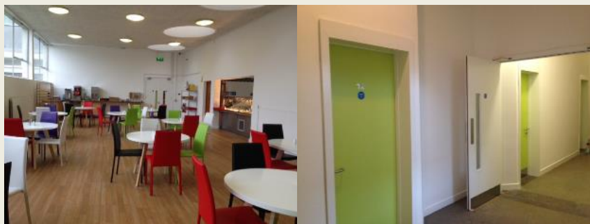
Above: Community Service Participants working on the Abigail Women's Centre, Finglas and images of the Centre on completion.

The initiative involves a range of agencies including the Dublin Region Homeless Executive, Dublin City Council, the Probation Service, the Irish Prison Service, HSE, and DCETB with the centre being run by two key agencies, DePaul Ireland and Novas Ireland.