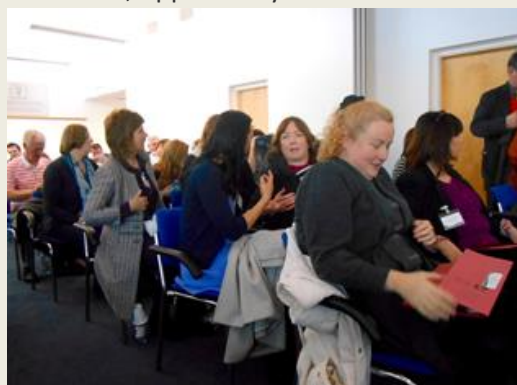
Above: Probation Service Staff attending the Conference