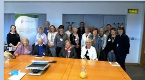
Pictured Above: Members of the Retired Association of Probation Officers Northern Ireland visiting friends and colleagues in the Probation Service.