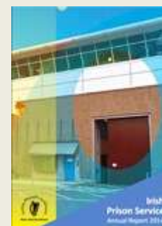
Irish Prison Service Annual Report 2014

There were 16,155 committals to prison in 2014 compared to 15,735 in 2013. The increase is attributed to an 8% increase in the numbers committed on sentences of less than 3 months specifically those committed for the non-payment of a court ordered fine.