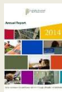
Probation Service Annual Report 2014

“The Probation Service continues to focus on increasing efficiencies in the way it does business within the criminal justice sector. Working with their colleagues in other agencies I can see that they are firmly on the road to supporting a just and effective penal system as envisaged by the strategic review of penal policy.”