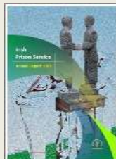
Irish Prison Service Annual Report 2013