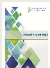
Probation Service Annual Report 2013

Copies of the Women's Strategy and Annual Reports are available by clicking on the appropriate link below: