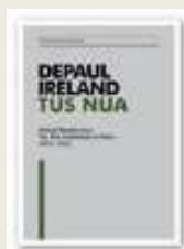
DePaul Ireland Tús Nua Annual Review 2013