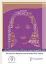
Joint PS/IPS Women's Strategy 2014-2016