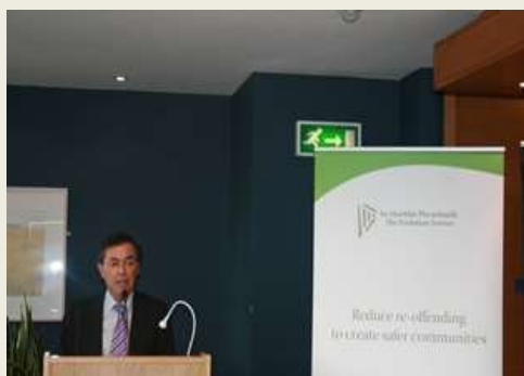
Above: Minister Shatter speaking at the launch event

Published on the week of International Women's Day, (8th March), the theme of which was "Inspiring Change", the Strategy is an acknowledgement by the Probation Service and the Irish Prison Service that together, they are changing the way they address the particular needs of female offenders.