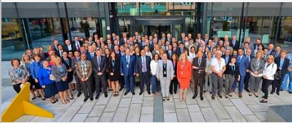
Pictured above: Delegates at the 22 nd Conference of Directors of Prison and Probation Services.

The the 22 nd Conference of Directors of Prison and Probation Services, was held in Lillestrøm, Norway, last month. The theme of the conference was: Staff Recruitment, Training and Development in the 21 st Century. More information, including the conference programme, presentations, and the agreed conclusion document of the conference, are available at the following link: